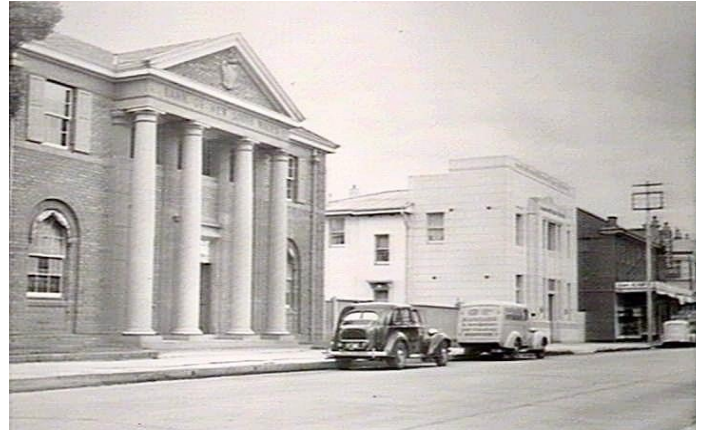
A fantastic photo of George Street Windsor circa 1940's

A suggestion was made that we do a series of the wonderful old photos that we post on our Living Heritage Facebook page. These photos are an historical record of the people, towns and cities of our great country. We hope you like them.