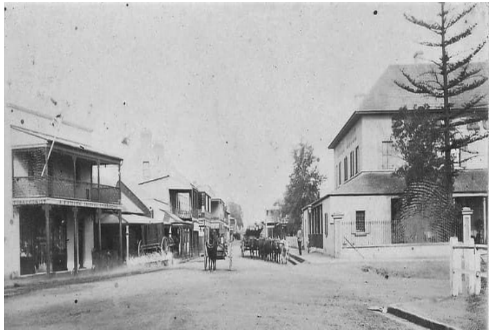
Bullock team hauling timber in George Street Windsor circa 1900

1. Eiffel Tower 2. Travel overseas 3. I understand 4. Hand in hand .....Solution to puzzle on page 19